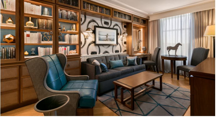
Embassy Suites by Hilton Berkeley Heights