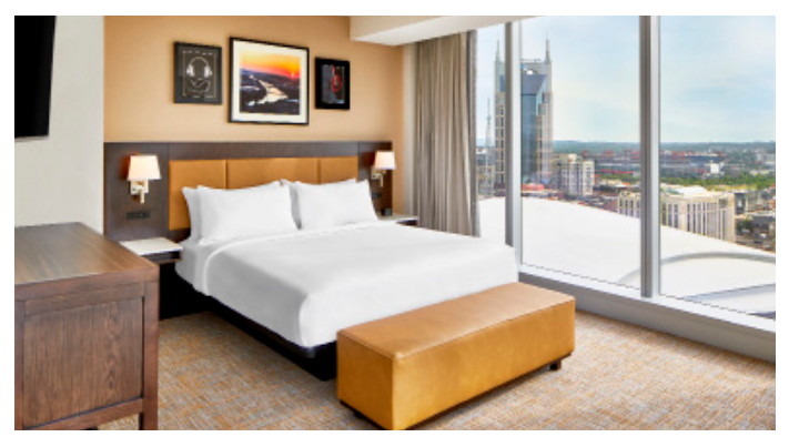
Embassy Suites by Hilton Nashville Downtown