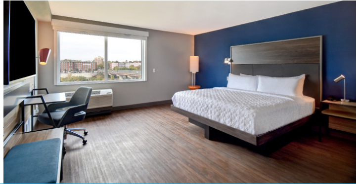
Tru by Hilton Manchester Downtown