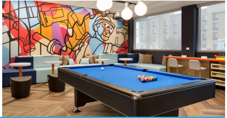
Tru by Hilton Las Vegas Airport